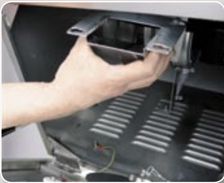
The airstream channel can easily be taken out of the machine for cleaning.

With the Bag Loader FKT 800 you are just quicker – and save time and money.