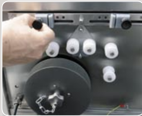
Easy and quick change of chain guide for new bag size.