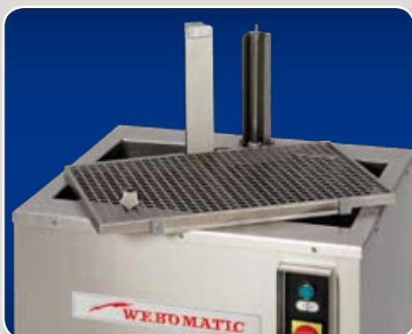
Hygienic cleaning: The dipping platform of the shrink tanks can be taken out of the tank quickly and easily.

Mode of operation of the shrink tanks: The products packed into bags are placed onto the dipping platform (1) and dipped into the hot water (2). By means of the short dipping process the bag material pulls itself smoothly around the product without wrinkles and the product, however, remains uninfluenced (3).