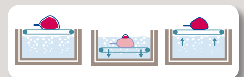
left side: ST 40/60-II

Mode of operation of the shrink tanks: The products packed into bags are placed onto the dipping platform (1) and dipped into the hot water (2). By means of the short dipping process the bag material pulls itself smoothly around the product without wrinkles and the product, however, remains uninfluenced (3).