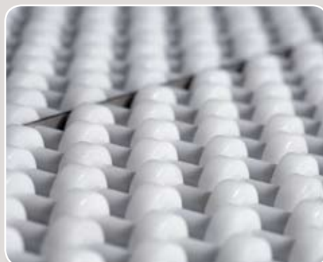
Practical: Instead of the stainless steel platform the optional roller platform is available, which facilitates loading and unloading.